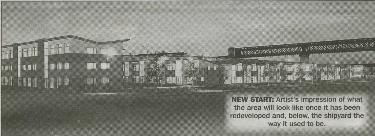
NEW START: Artist's impression of what the area will look like once it has been redeveloped and, below, the shipyard the way it used to be.